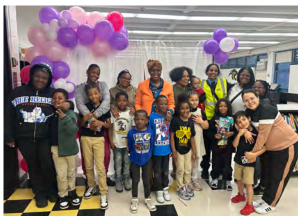
Muffins with Mom at 13th Avenue School, May 9.