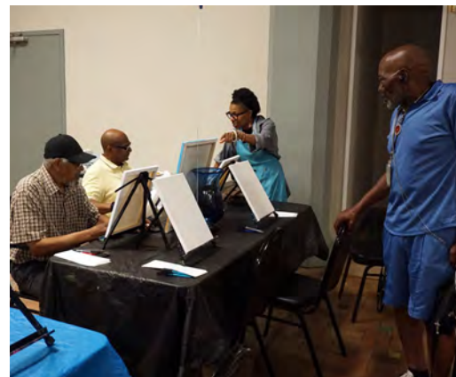
Part of the Douglas Homes Father's Day Luncheon on June 13 included painting.