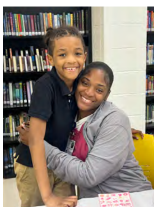
Muffins with Mom at 13th Avenue School, May 9.