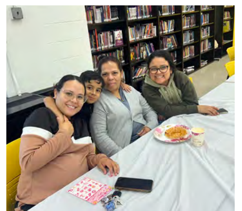
Muffins with Mom at 13th Avenue School, May 9.