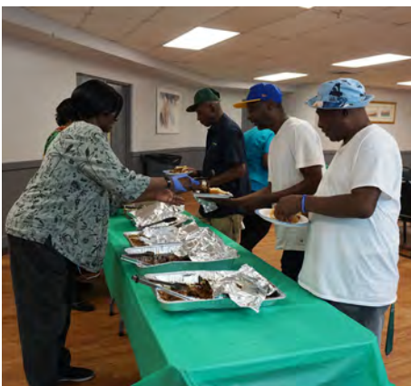
Commons Senior residents enjoyed a Father's Day Luncheon on June 13.