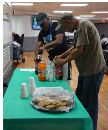
The men of Commons Senior enjoyed the Father's Day celebration on June 13.