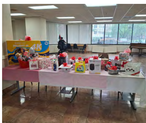
Associates Mother's Day Bingo prizes, May 9.