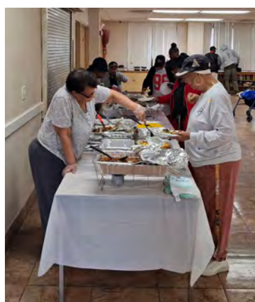
Associates Mother's Day Celebration, May 9.