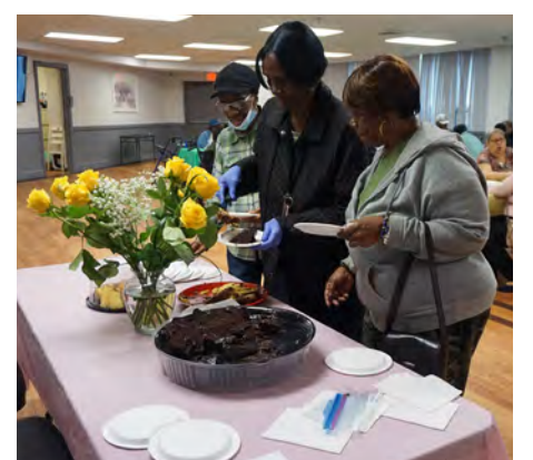
Commons Senior Mother's Day Luncheon, May 9.