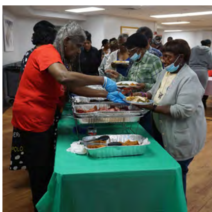
Commons Senior Mother's Day Luncheon, May 9.