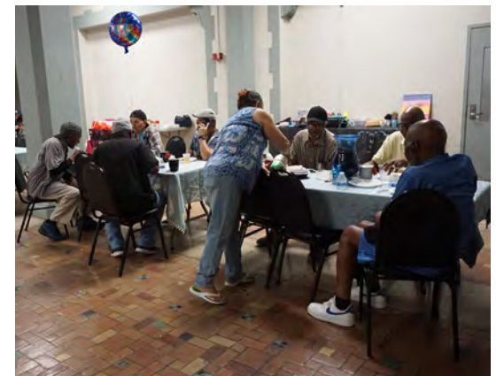
The dads of Douglas Homes were treated to a luncheon on June 13.