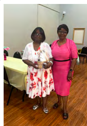
Mother's Day basket winner at Roseville Senior, May 9.